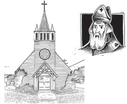
Saint Patrick Mission Park & Pershing Sts, Loleta, CA 95551