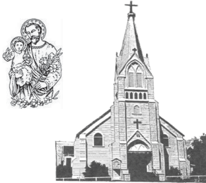
Saint Joseph Parish 14th and N St. Fortuna, CA 95540