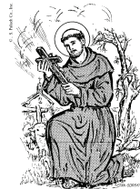
St. Francis of Assisi