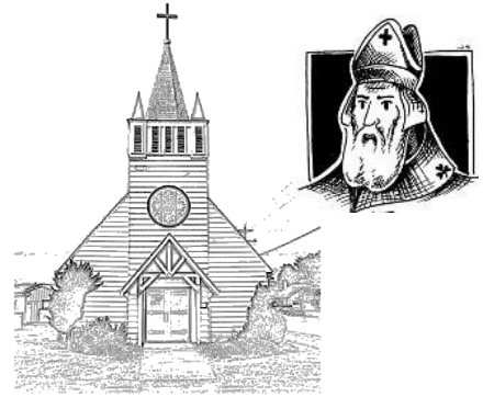
Saint Patrick Mission Park & Pershing Sts, Loleta, CA 95551

Sunday, June 23, 2013 Twelfth Sunday in Ordinary Time