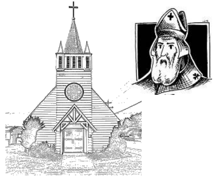
Saint Patrick Mission Park & Pershing Sts, Loleta, CA 95551