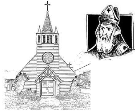
Saint Patrick Mission Park & Pershing Sts, Loleta, CA 95551

Sunday, February 2, 2014 FOURTH SUNDAY IN ORDINARY TIME