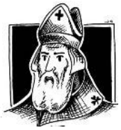
Saint Patrick Mission Park & Pershing Sts, Loleta, CA 95551

Sunday, December 22, 2013 FOURTH SUNDAY OF ADVENT