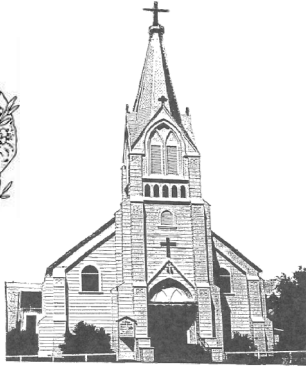
Saint Joseph Parish 14th and N St. Fortuna, CA 95540