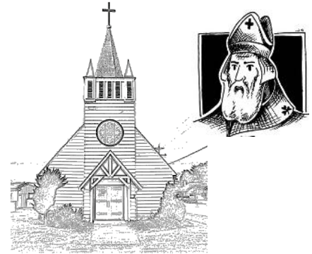
Saint Patrick Mission Park & Pershing Sts, Loleta, CA 95551