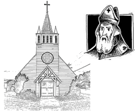
Saint Patrick Mission Park & Pershing Sts, Loleta, CA 95551

Sunday, October 28, 2012 Thirtieth Sunday in Ordinary Time