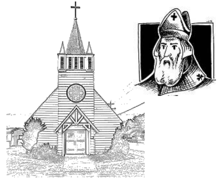
Saint Patrick Mission Park & Pershing Sts, Loleta, CA 95551

Sunday, January 12, 2014 FEAST OF THE BAPTISM OF THE LORD