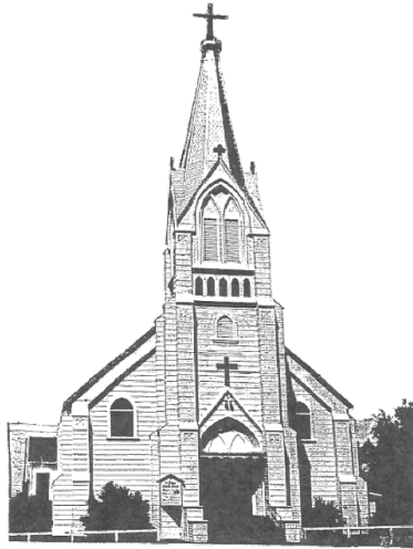
Saint Joseph Parish 14th and N St. Fortuna, CA 95540