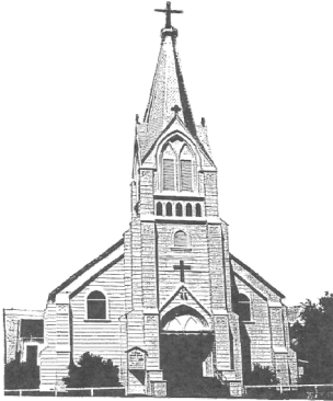
Saint Joseph Parish 14th and N St. Fortuna, CA 95540