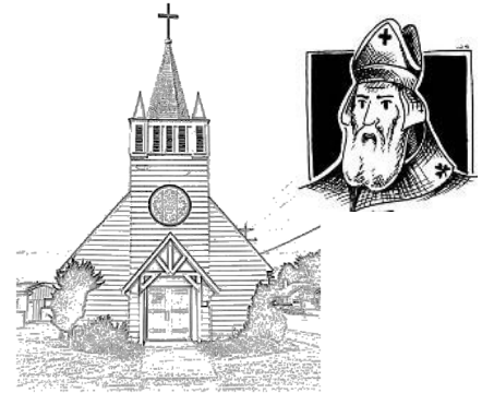
Saint Patrick Mission Park & Pershing Sts, Loleta, CA 95551