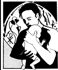
Happy Father's Day